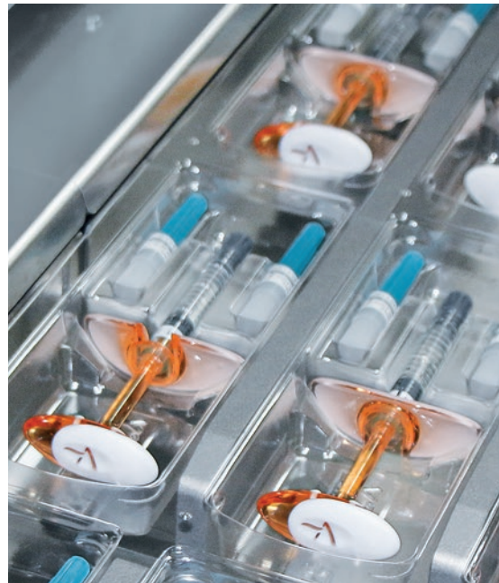
Right: Laboratoires VIVACY develops, produces and distributes medical injectables used, for example, to fill wrinkles.