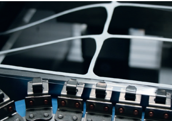
Above: With the KBS-KF blister machine, the clever placement of the blisters after die-cutting leaves only a little material remains.